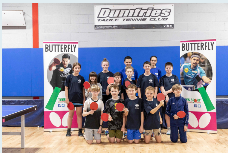
Table Tennis For All